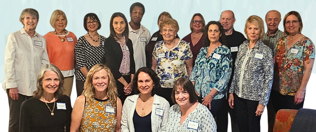
Board members, volunteers, and staff at Vita's 2025 Volunteer Celebration