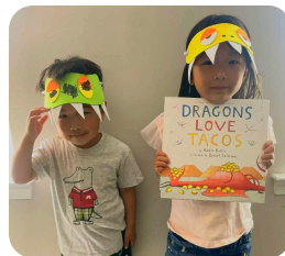
Children from Bristol Family Literacy class.